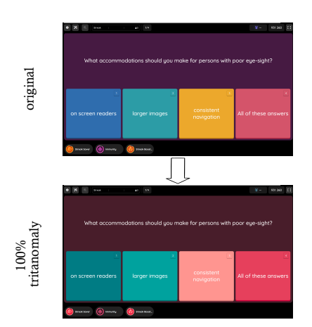
Figure 2: Screenshot processed with simulated CVD simulation [MOF09]. Contrast across UI components can often be reduced.