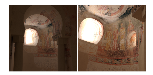
Figure 4: Physically accurate simulations on a medieval church.