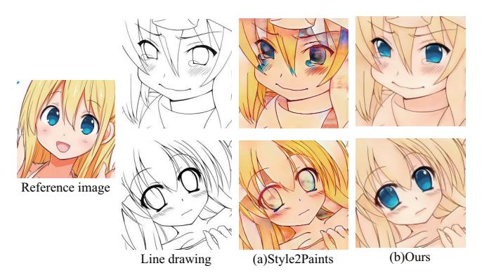
Figure 3: Comparison of colorizing multiple line drawing inputs.