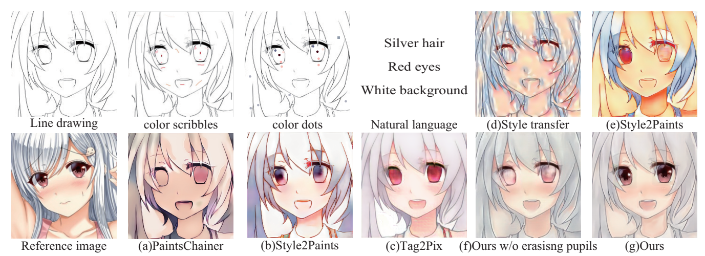
Figure 1: Comparison between existing colorization methods [Yon17, 11118, KJPY19, LAGB16] and proposed method. The color reference inputs are (a) color scribbles, (b) color dots, (c) natural language, and (d, e, f, g) color reference images. All output images are colorized based on the reference color image. The existing methods roughly colorize the line drawing but cannot express pupil details. The proposed method accurately colorizes the line drawing and generates pupil details based on our novel dataset of line drawings with empty pupils.