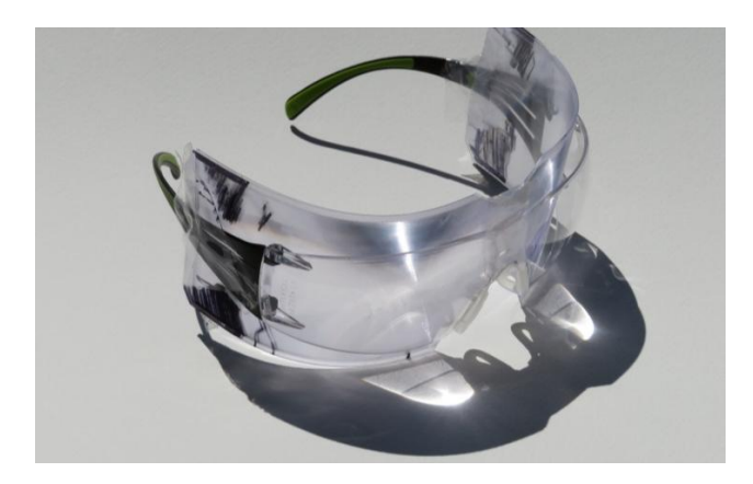
Figure 2: The wide-FOV curved Fresnel glasses prototype.

Figure 2 shows the wide-FOV Fresnel glasses prototype. The safety glasses did not cause optical distortions or significant obstructions, as they were frameless. The weight of the construction is 34g (of which 19g is the safety glasses).