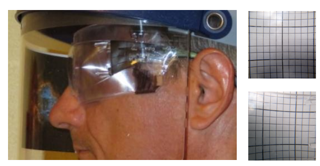
Figure 3: Left: Fresnel glasses with a head-mounted image plane (left eye image removed for clarity). Right: Views to front and 65° to the side.

widest angle) taken from the eye position through the Fresnel lens towards directly front and with the camera rotated 65° to the side. The resolution is preserved well in all directions.