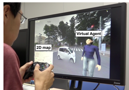
Figure 1: System Overview

Figure 1 shows an overview of our proposed system. In the system, the user is able to stroll anywhere they want to visit (e.g., the