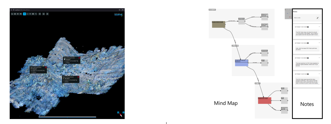
(c) A screenshot of the Digital Earth Viewer displaying point cloud photogrammetry data of a deep sea black smoker vent field (d) A section of the Mind Map component of the DLB showing the mind map and notes created by the user to externalize insights.