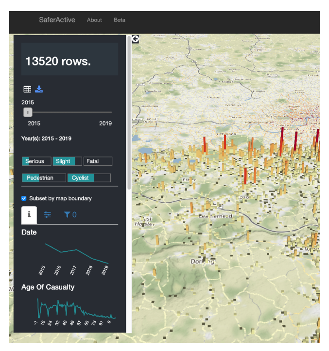
Figure 3: A customised version of Turing Geovisualization Engine showing UK road casualty data. The default view of the a deployment of the SaferActive project shows an area of south London with columns of the dataset featured on the sidebar of the TGVE to focus on and filter the data based on those columns (accident severity, casualty travel mode, etc).

Certain DeckGL layers ("grid layers") are aggregation layers that first enable the user to see an overview of the spatial extent of the dataset, before drilling down into the details as needed. In the TGVE, mouse hovering on areas of the visualization can be used to generate line charts for a subset of the data (see 4.1). The slippy maps in general (vector or raster tiles) are hierarchies of overview-