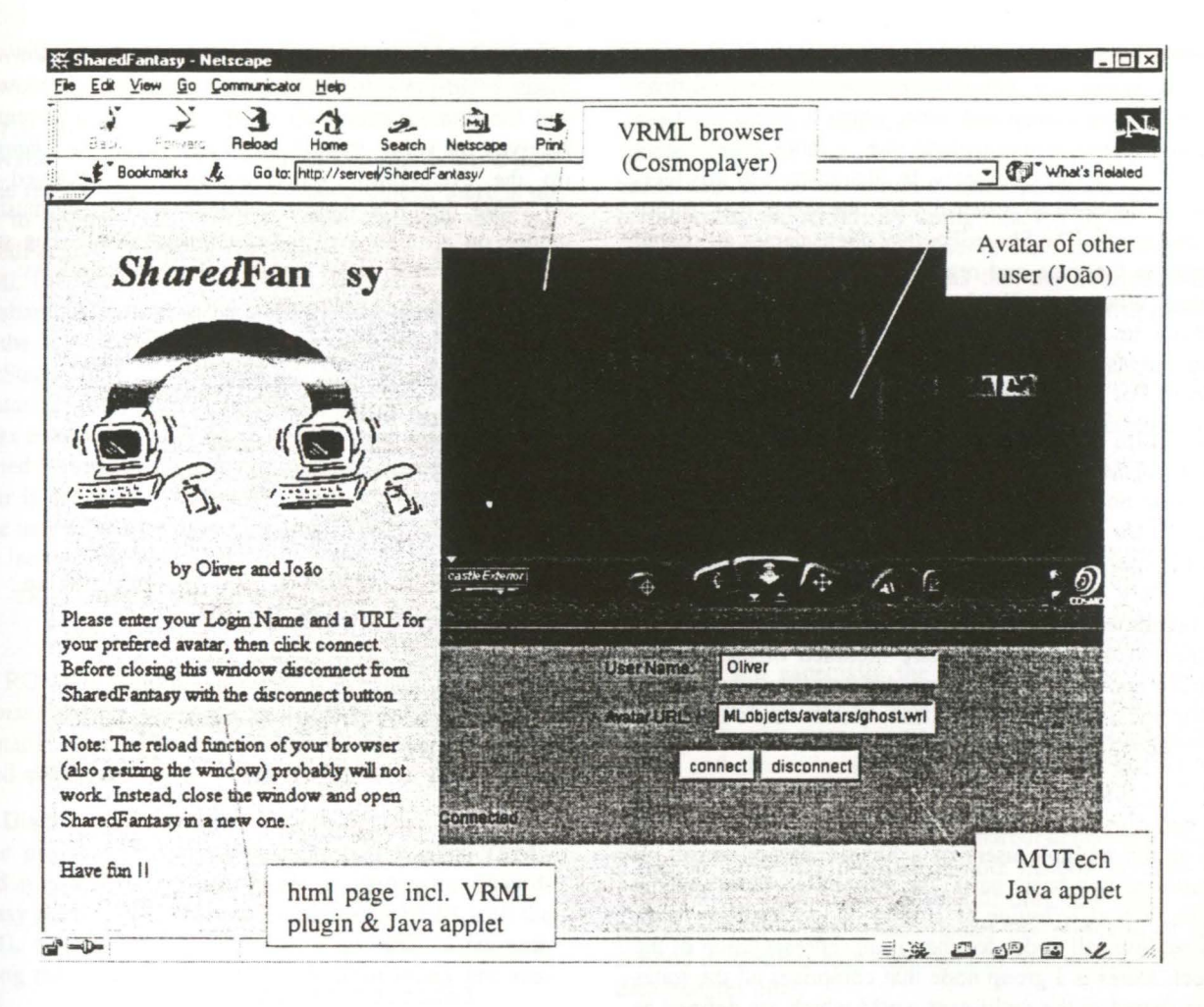
Figure 3 - Screenshot of the SharedFantasy user interface

When SharedFantasy is accessed with a normal URL for the HTML page on the chosen server, the VRML Plug-in and the JVM are started and the shared VRML world and the Java applet are loaded. After the applet is completely loaded, its Graphical User Interface (GUI) becomes visible. To enter the SharedFantasy world the user must connect to the SharedFantasy MUTech server, by entering a login name and by specifying an URL for a VRML file, which will be the visual representation of the user. When the user is connecting to the SharedFantasy world, the state of the world is synchronised with the global state, as maintained by the server, and the avatars of the other users are added to the world.