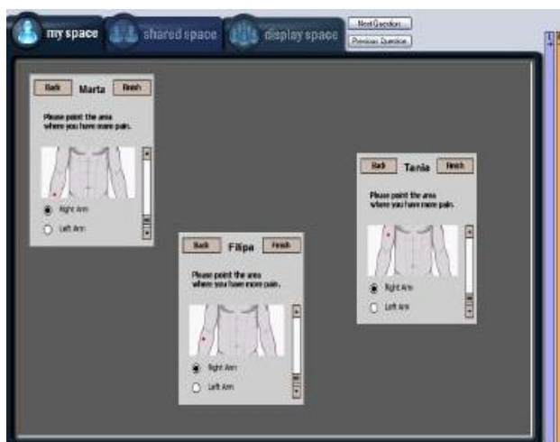
Figure 2. Workspace Management

On the right side of figure 2 two vertical bars are visible that provide access to a set of auxiliary components. When opened they offer the elements visible in figure 3. The "Listing tool" (on the left) is used for the selection of data, usually published to the private space. It permits several working modes. For example: (1) select data for one specific form, from all selected patients; (2) select data of several forms for one patient (view patient evolution); (3) select ongoing patient task. Specific patients can also be selected and the destiny workspace chosen.