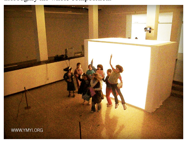
Fig. 4. Picture of users experiencing the YMYI artefact.

YMYI was setup on a conference room, shared with other conference activities. At the time of the performance, the computer running the software exhibited some latency to process the movements of the dancer, which were noticed and incorporated by the dancer in his performance. In his words: "My interaction with the machine resulted in a growing adjustment of both my sensitiveness and fine motor skills so that my body became more suitable to every movement to be projected onto the screens. The moving field for the image motion capture that I had at my disposal was a truly narrow space, which posed additional difficulties to my improvising dynamics and composition." He also reported that his interaction with the system posed him some challenges: the standard-slow motion capture of the sensor device compelled him to keep a low performance body speed and from that latency create an imaginative rhythm to keep an interest in both his displayed image and his movements He stated that to take advantage of the system, he had to reinvent himself to develop thoroughly his whole composition.