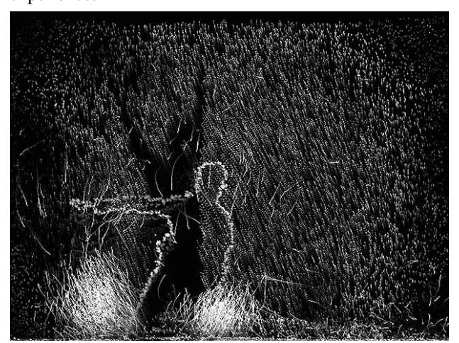
Fig. 1. The YMYI artefact.

YMYI motivation is to allow the performer to observe and give evidence to an artistic expressiveness developing in the mind an array of gesture ongoing instantiations. These physical expressive gestures are rendered in digital compositions formed by musical and visual movements, composing an enriched audio-visual experience.