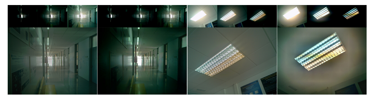
Figure 4: Results obtained with the N900 using our application (left) and HDR Capture app (right) by Nokia Beta Labs. Insets show the images used to build the final one. Examples taken with auto exposure in both applications. We can see how our application produces a more detailed and natural look.