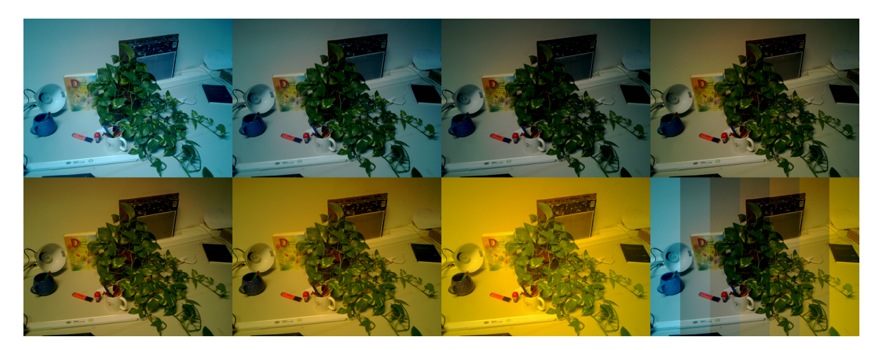
Figure 5: From left to right, up to down: sequence of images obtained by capturing the same scene with white balance ranging from 2800K to 11000K. Bottom right shows the selection image presented to the user in order to choose the preferred color temperature.