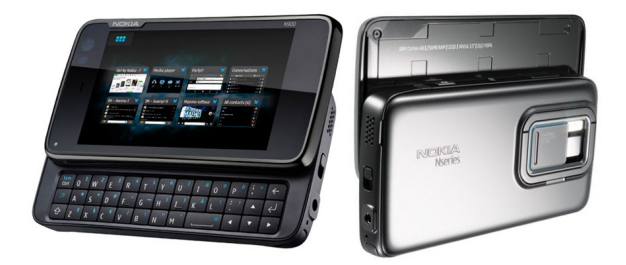
Figure 2: Front and rear views of the Nokia N900 smartphone.