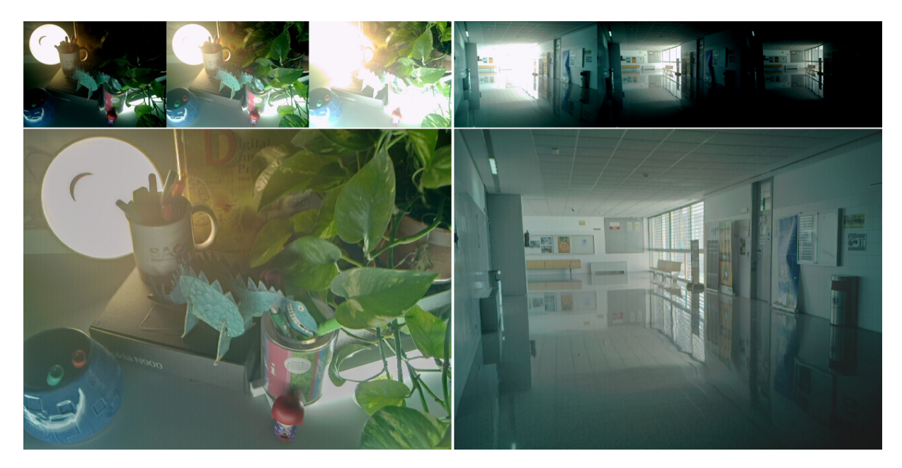
Figure 3: Two examples of photos captured and processed by our method. The insets show the bracketed sequence input. The complete pipeline takes less than 20s for a resolution of 640x480. Left: auto exposure. Right: manual selection of three EVs out of five.