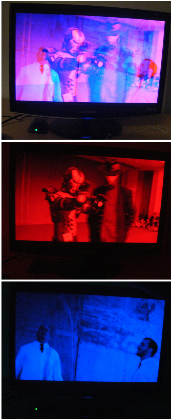
Figure 3: Stereo video player for two users. Top, actual view of the monitor, showing both videos. Center, viewing the monitor through a red filter. Bottom, viewing the monitor through a blue filter.