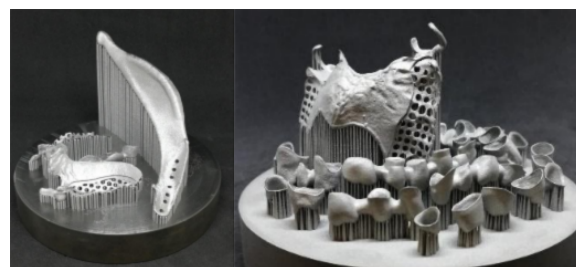
Figure 1: Based on the list of orders and their priorities, the same building platform may be filled differently. On the left, the denture (sheet) is an urgent order, hence it is placed horizontally for fast production. On the right, the same part is placed vertically so that more parts can be produced in the same overnight session.

The main objective in ProMED is to optimize the overall process according to one (or a combination) of the aforementioned measures, and to effectively predict them for different scenarios and configurations. This would make it possible to make faster and