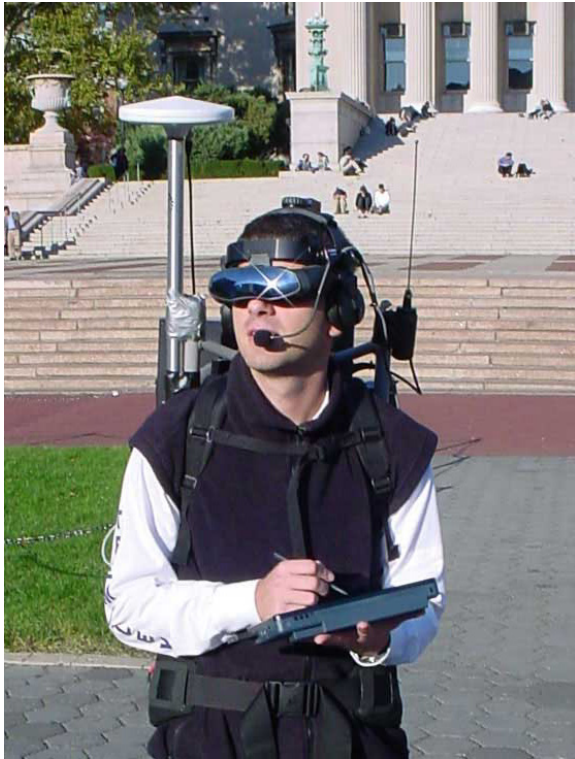
Figure 1: Current generation of the Columbia “Touring Machine” mobile augmented reality system.