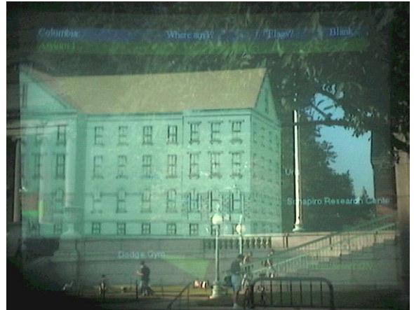
Figure 2: Situated documentary shows in situ models of demolished buildings formerly occupying our campus (imaged through optical see-through, head-worn display).