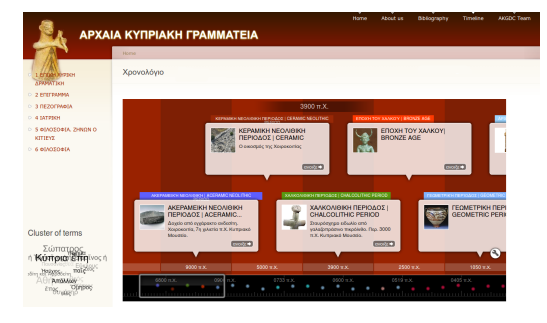
Figure 1: AKGDC timeline

Apart from individual use, the AKDGC can also be further implemented in the curricula of secondary and tertiary education. Already, the gradual publication of the AKG volumes has triggered the introduction of ancient Cypriot literature University courses, both undergraduate and graduate, into the University of Athens (Department of Philology). Also, an anthology of Cypriot literature, culled from