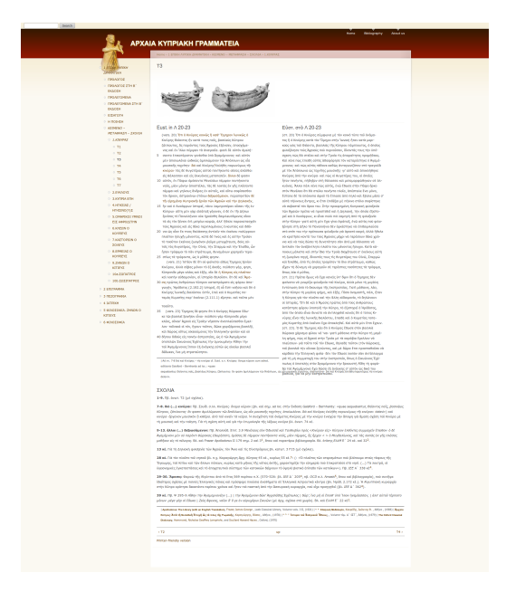
Figure 3: Example of a complete page

While taking into account the user's needs, we evaluate alternatives based on content presentation, navigation and hierarchy, interaction and ergonomy.