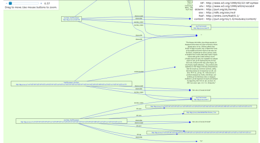
Figure 4: Semantic graph example of a RDFa page