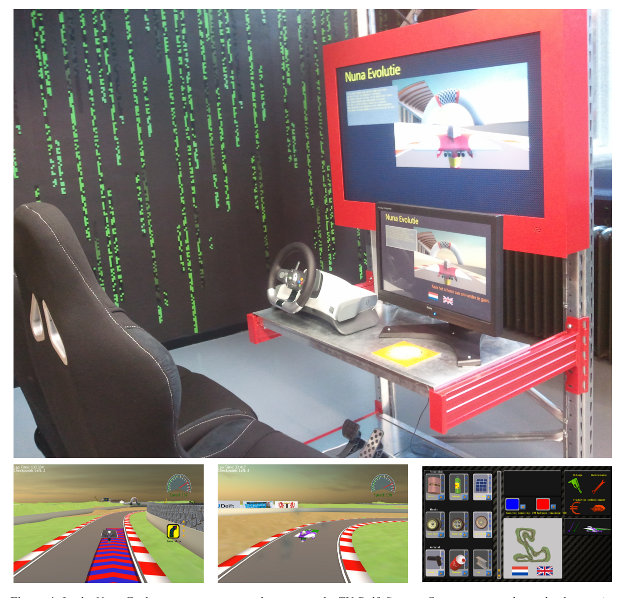
Figure 4: In the Nuna Evolution game, as currently set up at the TU Delft Science Centre, a team adjusts the design of their race car while they are racing on the track. To further motivate players, we used the model of the Nuna Solar car, the award-winning solar vehicle designed at TU Delft.

enhancing game characters with emotions). It goes without saying that eventually numerous CS alumni either have found their career in one of the various game development companies they met during this project, or established their own start-up companies in the field, supported by our university's start-up incubator; in both cases, they gladly maintain a close collaboration with us.