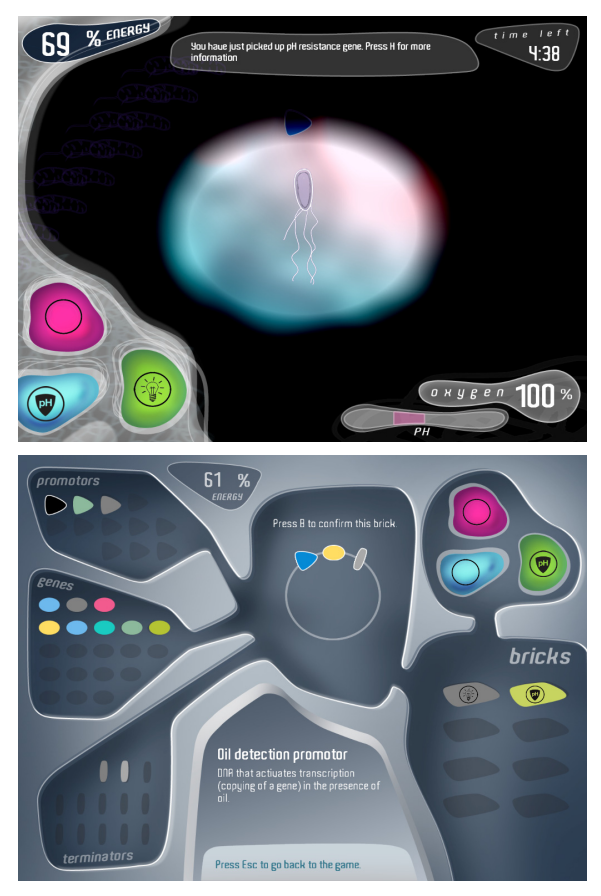
Figure 2: Pimp up your bacterium, a serious game in which children learn synthetic biology concepts while driving a bacterium through adverse obstacles (above), in order to acquire the necessary enhancements that enable it to neutralise the Gulf oil slicks (below).

sioning partners, in terms of dedication, feedback and assessment, even though the serious game delivered is simply a prototype and not an end-product.