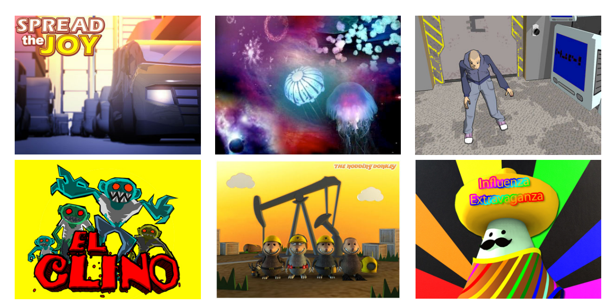
Figure 3: Screenshots and concept art from the games produced in the Games Projects of the last three years

At the same time, the team has to decide and watch over the project work plan in order to produce the scheduled deliverables and achieve the proposed goals in due time. Of course, this includes assigning and personally assuming the roles that better suit each of the team members. Typically, CS students will carry (most of) the implementation burden, whereas students of other faculties will mostly fulfil other crucial roles, including designer, producer, artist, modeller, tester, etc.